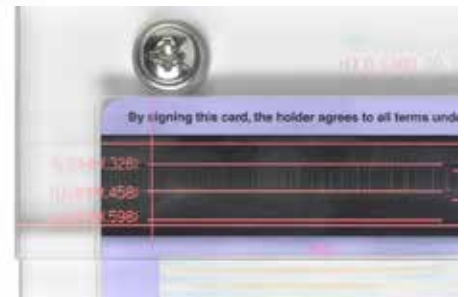
Portion of developed card with Q-View magnetic developer