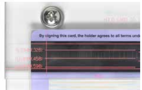
Portion of developed card with Q-View magnetic developer